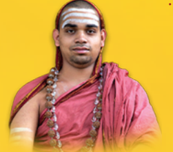
Tath Kara Kamala Samjathulu Sringeri Sharada Peeta Maha Sannidanam

Sri Sri Sri Bharathi Theertha Mahaswamy Blessings