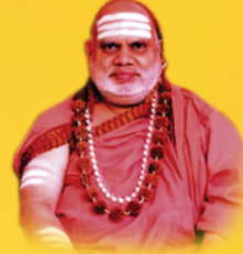
Dakshnamnya Sringeri Sharada Peeta Maha Sannidanam