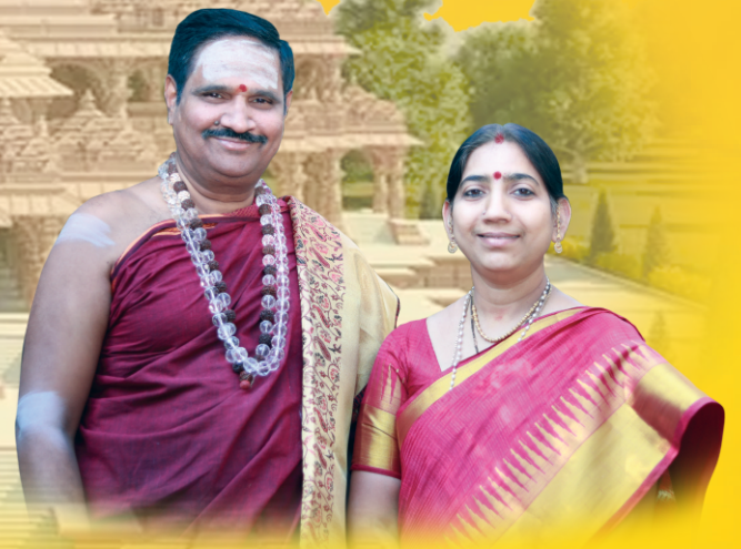
Pujya Guru Dampathi